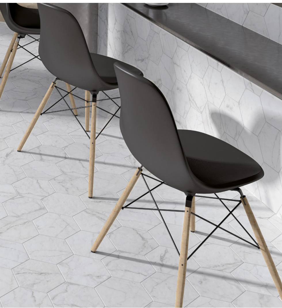
Carrara Hexagon Matt 17,5 x 20 cm / 7" x 8"