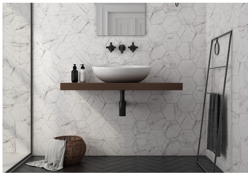
Carrara Hexagon Matt 17,5 x 20 cm / 7" x 8" Stromboli Black City 9,2 x 36,8 cm / 3½" x 14½"