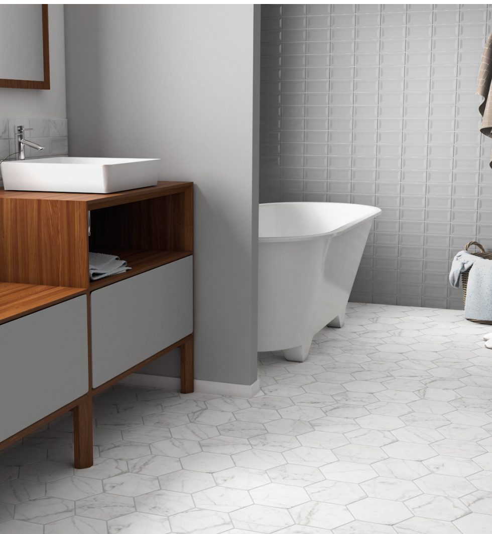
Carrara Hexagon Matt 17,5 x 20 cm / 7" x 8" Carrara Matt, Carrara Inmetro Matt 7,5 x 15 cm / 3" x 6" Evolution Inmetro Light Grey 7,5 x 15 cm / 3" x 6"