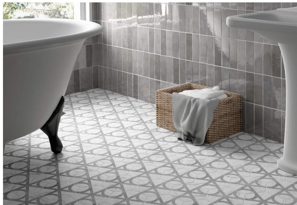
Carrara Hexagon Flow 17,5 x 20 cm / 7" x 8" Artisan Alabaster 6,5 x 20 cm / 2½" x 8"