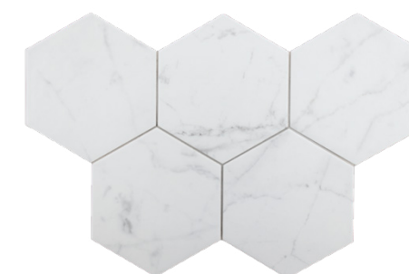
Hexagon Carrara Matt