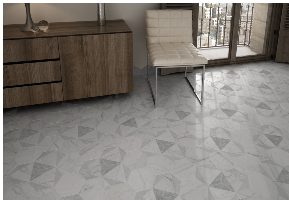
Carrara Hexagon Peak 17,5 x 20 cm / 7" x 8"