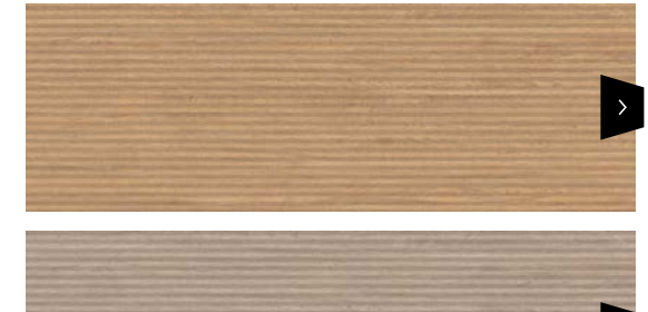
WALL JACKSON HONEY