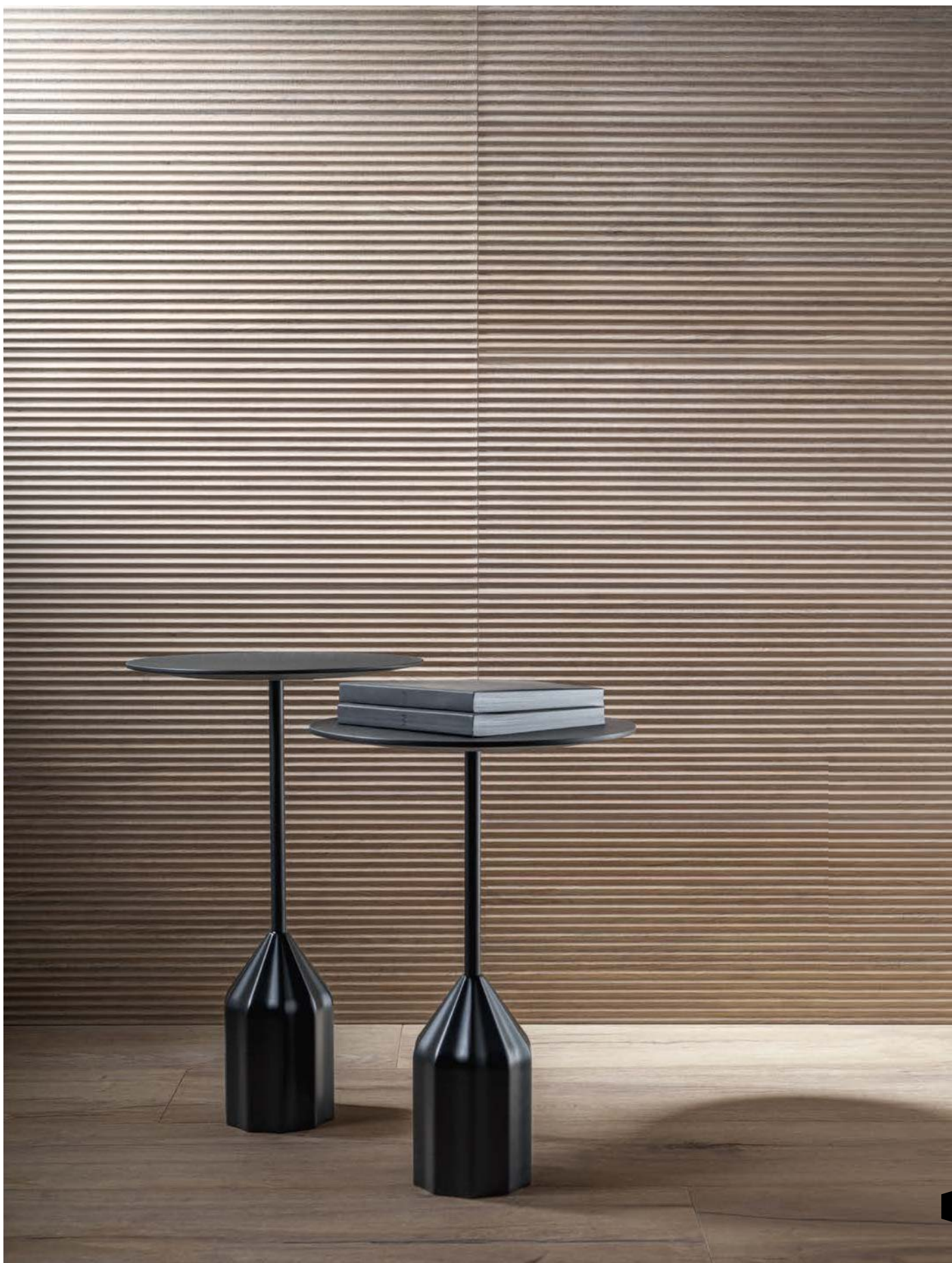
JACKSON HONEY DECOR_33,3*100 SP_24*151 AS