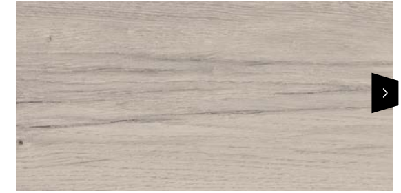
FLOOR & WALL JACKSON ASH