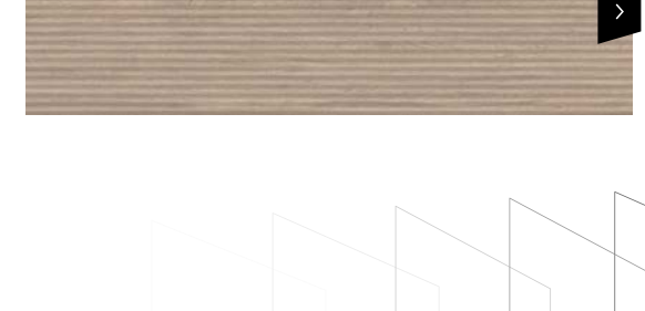
WALL JACKSON TAUPE