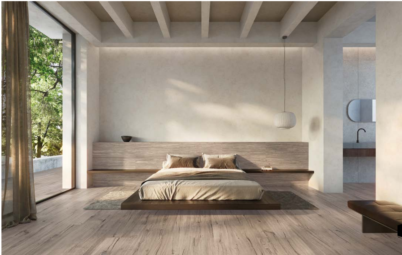
JACKSON TAUPE_24*151 AS TAUPE DECOR_33*100 SP ALCHEMY EARTH_90*90 AS