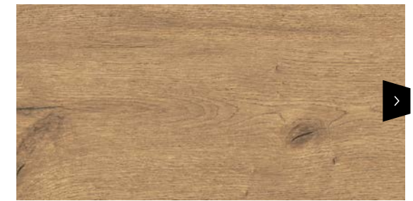
FLOOR & WALL JACKSON HONEY