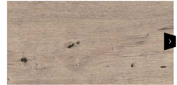
FLOOR & WALL JACKSON TAUPE