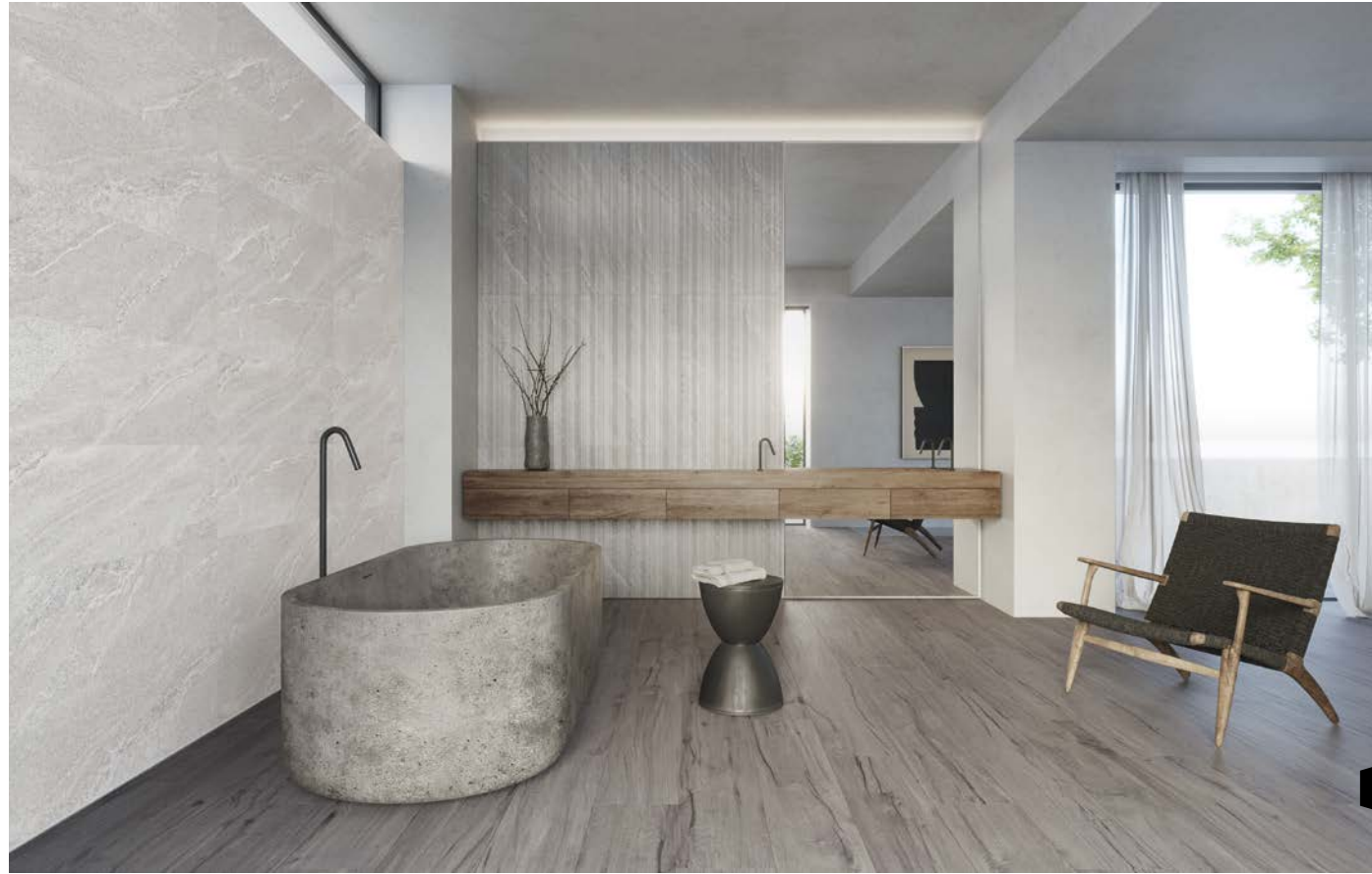
JACKSON ASH_24*151 AS ALCHEMY PEARL_33*100 PEARL DECOR_33*100