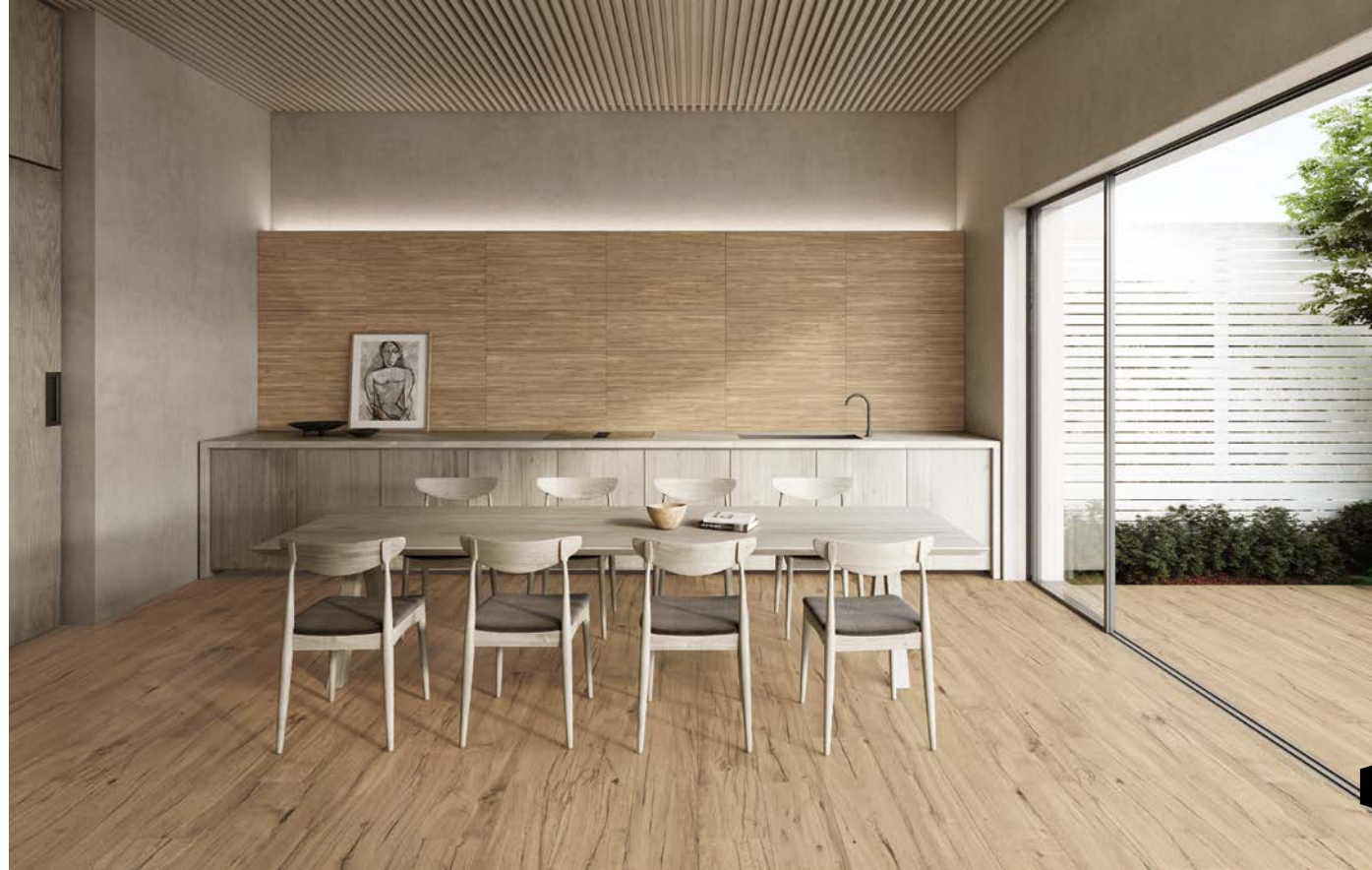
JACKSON HONEY_24*151 AS HONEY DECOR_33*100 SP ALCHEMY PEARL_100*275 SP