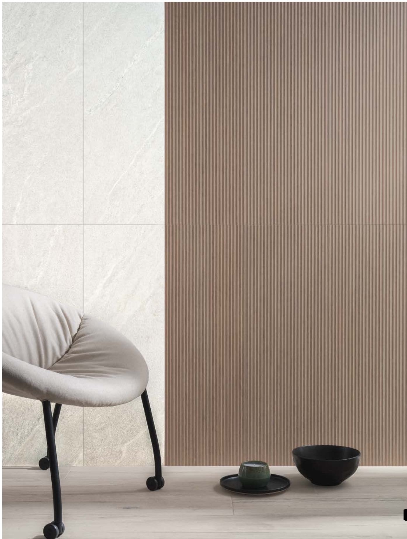
JACKSON TAUPE DECOR_33,3*100 SP JACKSON ASH_24*151 AS ALCHEMY PEARL_33,3*100