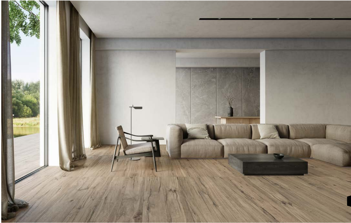
JACKSON TAUPE_24*151 AS ALCHEMY IRON_100*275 SP