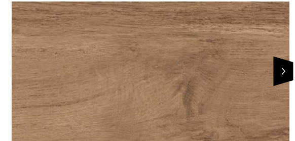
FLOOR & WALL JACKSON WALNUT