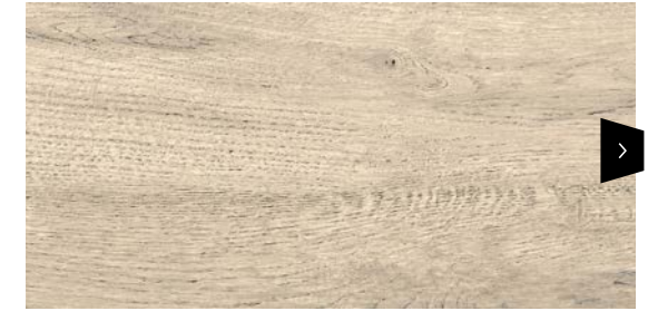
FLOOR & WALL JACKSON MAPLE